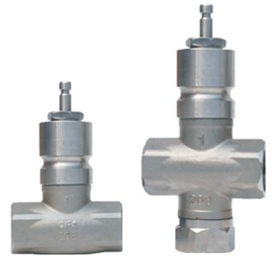
• Fig. RMU030